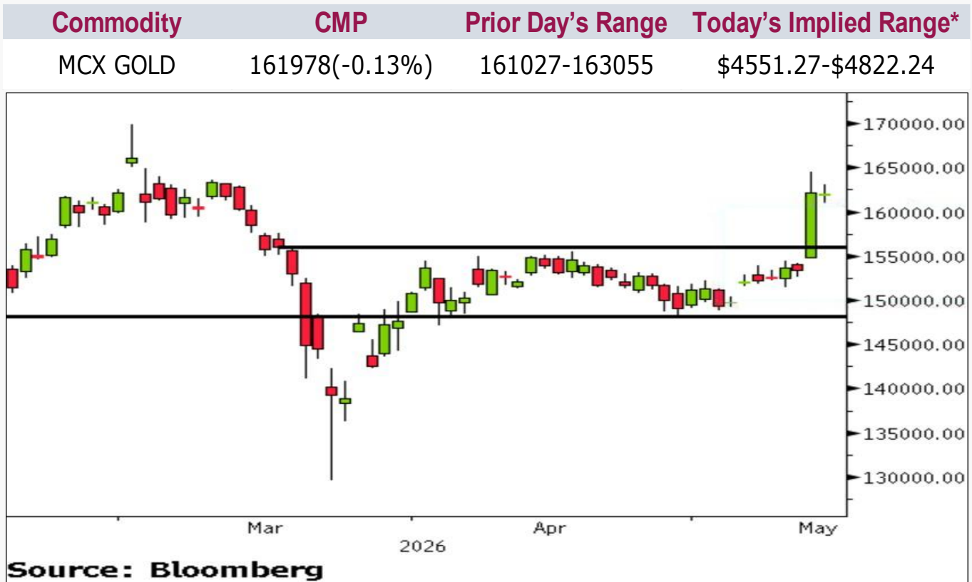
Implied range is for the Comex front-month futures